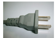
Chinese AC power plugs

UNESCO/IOC Regional Office for the Western Pacific (WESTPAC) and, National Marine Data and Information Service (NMDIS)