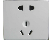
A typical Chinese socket

China uses 220V electricity with the following electrical outlets. Please bring a suitable adaptor if possible.